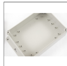
Internal mounting points for PC boards or panels