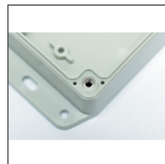
Features corrosion resistant inserts for lid assembly