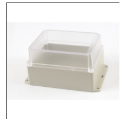
Some models supplied with deep lids.