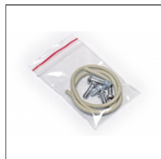
Hardware includes lid screws, PC board screws, and gasket