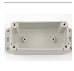
Internal DIN rail mounting point.