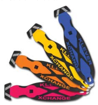
Available in Red, Orange, Yellow, and Blue.