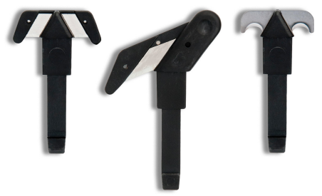
Klever XChange Replacement Heads

Interchangeable, quick-change, snap-in heads for the Klever XChange and XChange PLUS Safety Cutters. Visit the Klever XChange Replacement Heads page for more information.