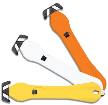
Available in orange, white and yellow.