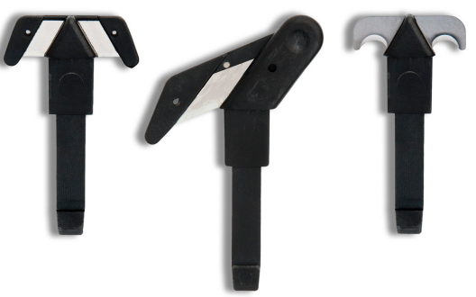
Klever XChange Replacement Heads

Precision cut guide reduces friction during cut.