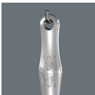
Joker 6004: Useful hole for hanging

Thanks to its hole the Joker can be neatly hung on the workshop wall.