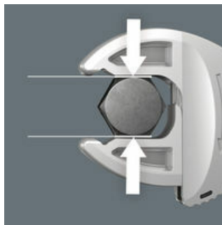
Joker 6004: Gentle to the screw

The parallel smooth jaws of the Joker 6004 allow surface pressure and can thus prevent rounding of the bolt or screw head, which can occur during power transmission on corners.