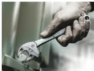
Joker 6004: Automatically and continuously self-setting