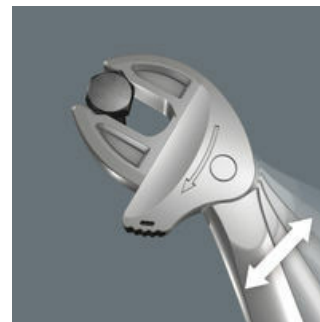
Joker 6004: Ratchet mechanism for fast work

The ratchet function in the mouth sees to fast and consistent screwdriving without removing the tool.