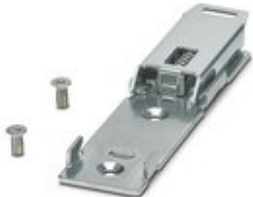
DIN rail adapter for screwing on switching devices

Please be informed that the data shown in this PDF Document is generated from our Online Catalog. Please find the complete data in the user's documentation. Our General Terms of Use for Downloads are valid ( http://phoenixcontact.com/download )