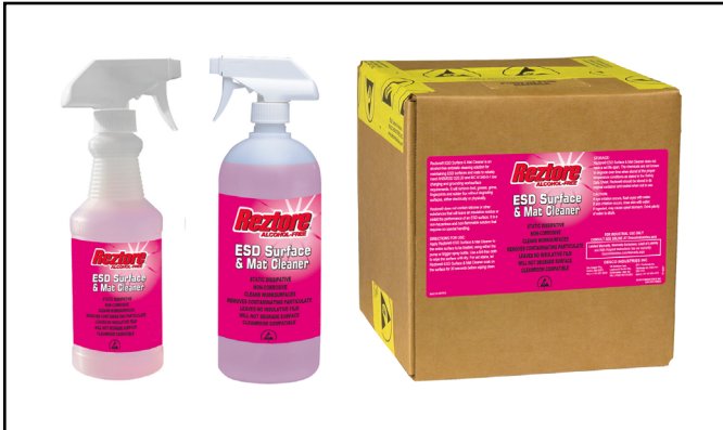
Figure 1. Reztore® Alcohol-Free ESD Surface & Mat Cleaner: 16 Ounces (450 ml) Spray Bottle 1 Quart (950 ml) Spray Bottle 2.5 Gallons (10 liters) Bag-in-Box