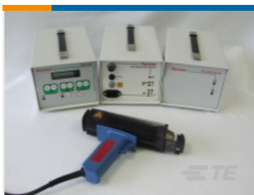
TE Part # CF0024-000 IR1759-MK4-AT3130-EDCONT