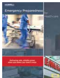
Emergency Preparedness for Healthcare