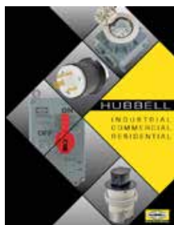
Full Line Catalog

Hubbell offers an extensive literature library for product support. Downloadable PDFs are available online.