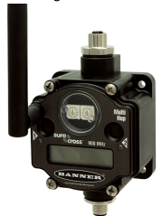
Figure 2. 10 to 30 V DC model