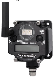
Figure 1. Internal battery model