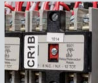
Panel component identification