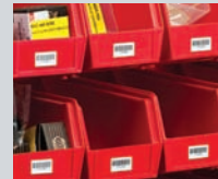
General ID and much more