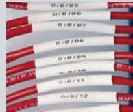
PermaSleeve® wire markers