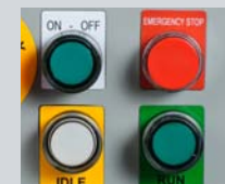
Raised panel labels and more