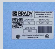
Product ID labels