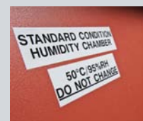
Lean / 5S labels and operations ID