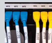
Voice and data communications