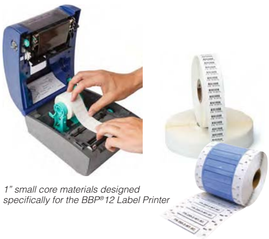
1" small core materials designed specifically for the BBP ® 12 Label Printer