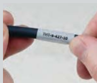
Wire marker labels and sleeves