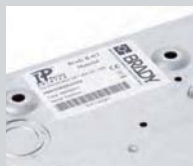
Asset tracking labels