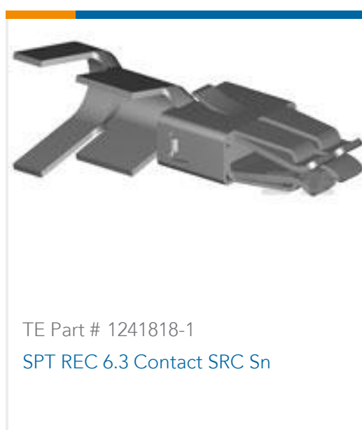
TE Part # 1241818-1 SPT REC 6.3 Contact SRC Sn