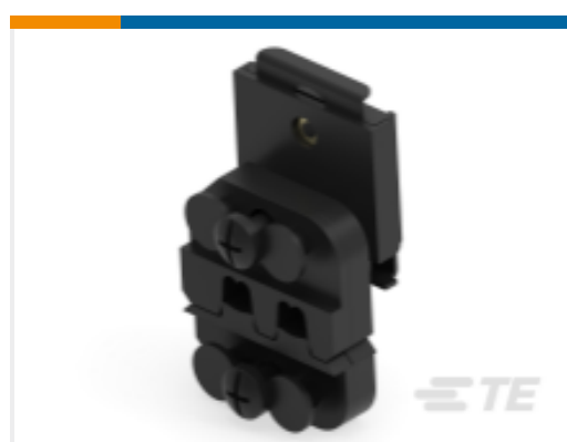
TE Part # 2385410-2 SDE F STND PWR TIMER 4-6mm2 DIE SET