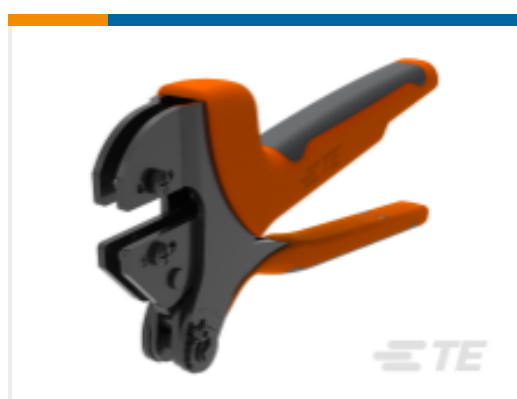
TE Part # 2362810-1 SDE CRIMP HAND TOOL FRAME