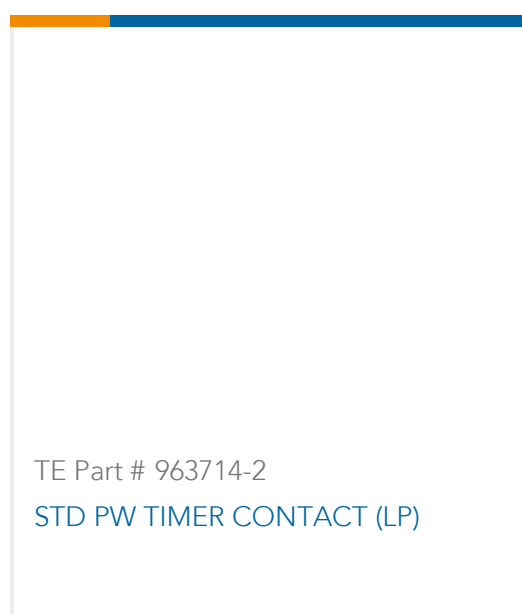
TE Part # 963714-2 STD PW TIMER CONTACT (LP)