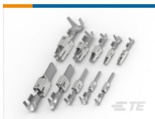
TE Part # CAT-T4827-T273 TIMER, RECEPTACLE AND TAB