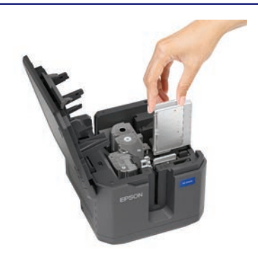
Replacement Full Cutter $15.00 | SKU CF001