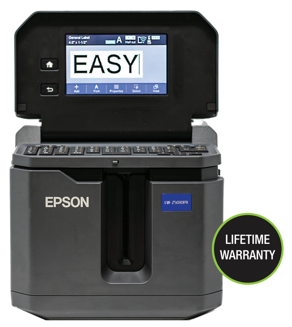
The Epson LabelWorks LW-Z5010PX

The Only Label Printer You'll Ever Need. The Last Label Printer You'll Ever Need to Buy.