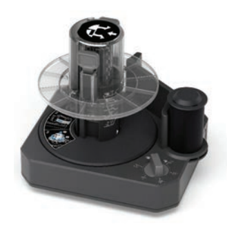
Rewinder Attachment $199.00 | SKU RW001