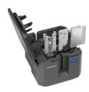
Replacement Half Cutter $15.00 | SKU CH001