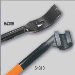
Hickeys & Grizzly Bar

Klein Tools' line of Ironworker's tools are engineered and manufactured to withstand rugged jobsite conditions and heavy use. From pliers to wrenches, rebar hickies to pins, leather and canvas pouches to connecting bars, each tool has been thoughtfully designed around the worker. Whether it's rebar work or structural work, Klein has something to meet the Ironworker's daily needs.