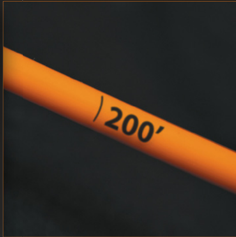
PERMANENT 1' MARKINGS