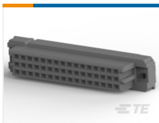
TE Part # 5536397-5 ASSY,RECEPT,EURO,TYPE C/2,LEAD