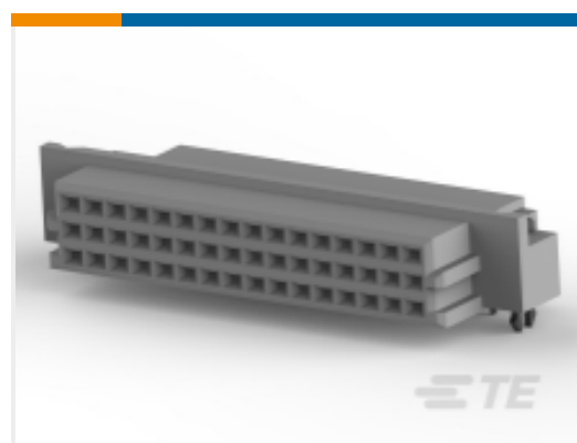
TE Part # 5650893-5 ASSY,RECEPT,EUROCARD,TYPE R/2,L-FREE,48,