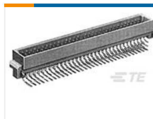
TE Part # 148078-1 016 EURO TYPE C PIN ASSY SEL