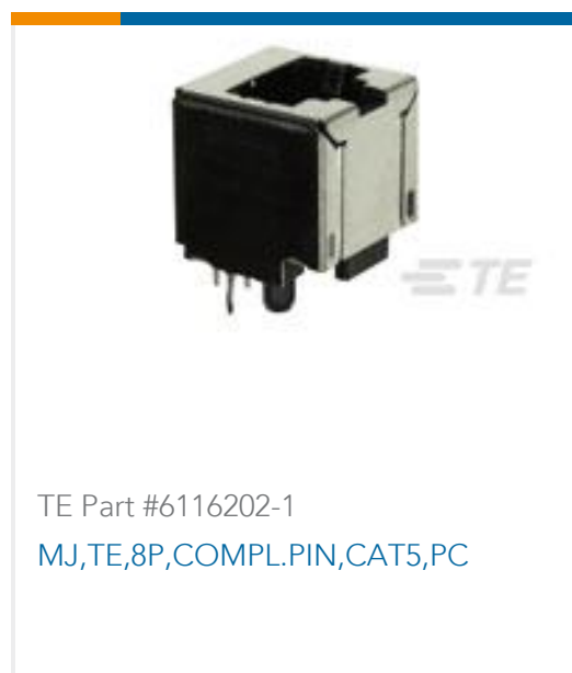
TE Part #6116202-1 MJ,TE,8P,COMPL.PIN,CAT5,PC