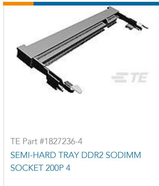
TE Part #1827236-4 SEMI-HARD TRAY DDR2 SODIMM SOCKET 200P 4