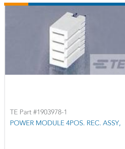
TE Part #1903978-1 POWER MODULE 4POS. REC. ASSY,