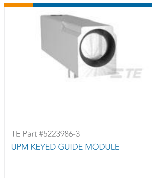
TE Part #5223986-3 UPM KEYED GUIDE MODULE