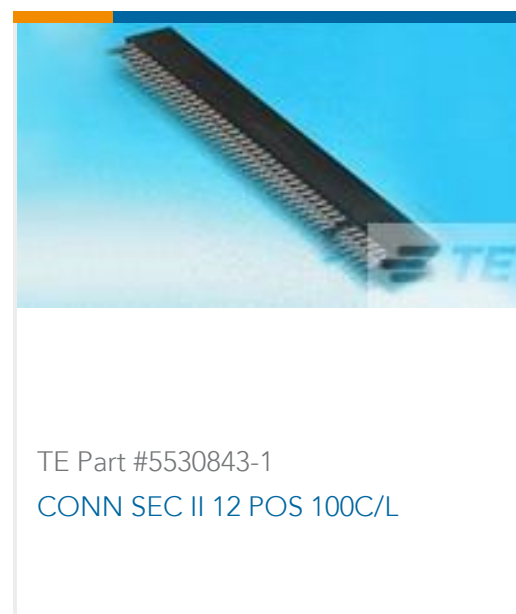
TE Part #5530843-1 CONN SEC II 12 POS 100C/L