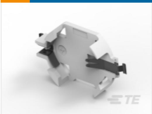
TE Part #2335232-1 ASSY, SMT BATTERY CONN