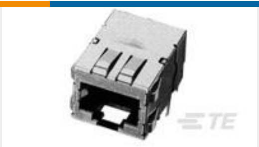
TE Part #1734509-4 RJ45,8P8C,W/LED,G/Y,50u"