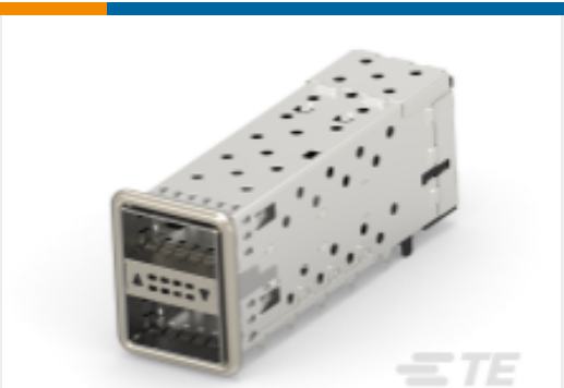
TE Part #2302407-1 QSFP+ ASSY, 2X1, GSKT, 2LP-OUTR, W/ CS GA