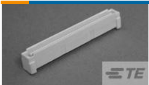
TE Part #3-5177986-1 0.8FH,P08H.5,040,08/Sn,TR,SC