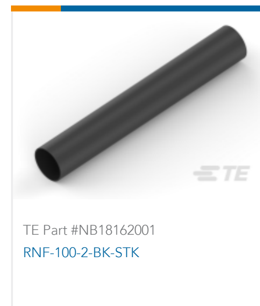
TE Part #NB18162001 RNF-100-2-BK-STK