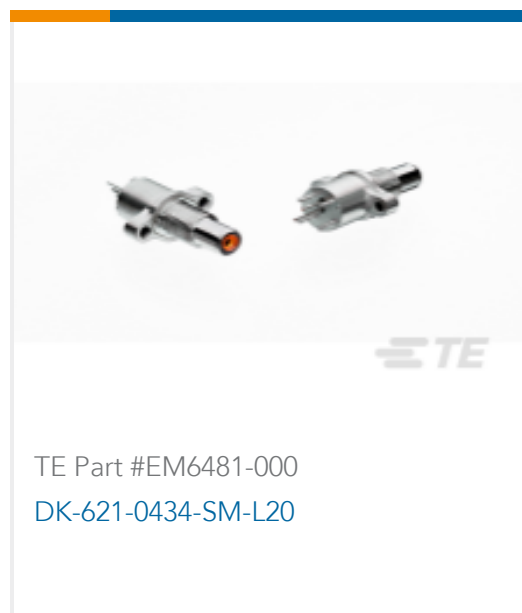
TE Part #EM6481-000 DK-621-0434-SM-L20