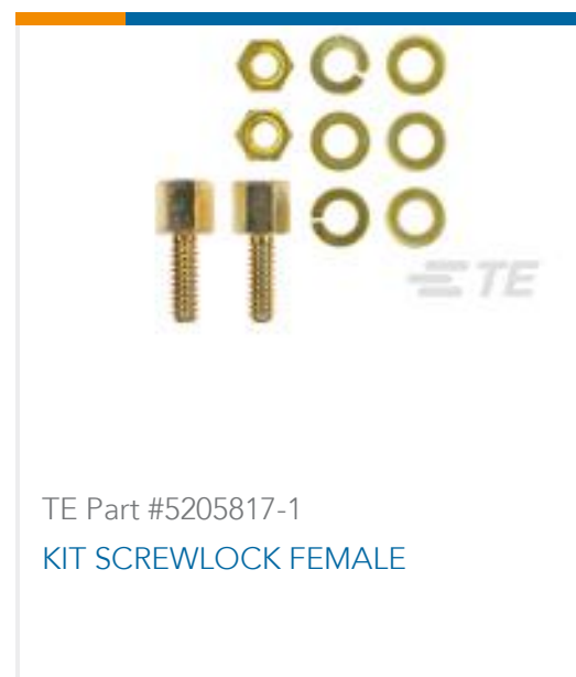
TE Part #5205817-1 KIT SCREWLOCK FEMALE