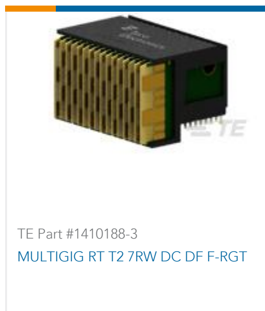
TE Part #1410188-3 MULTIGIG RT T2 7RW DC DF F-RGT