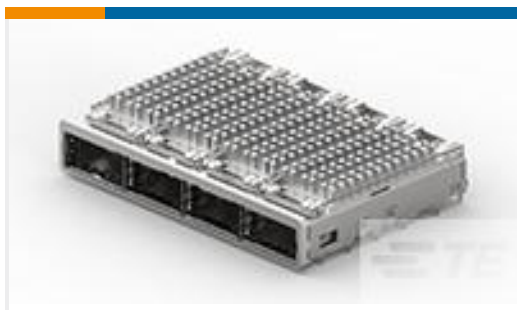
TE Part #2227249-2 1x4 Cage Assy Bhnd Bzl QSFP28