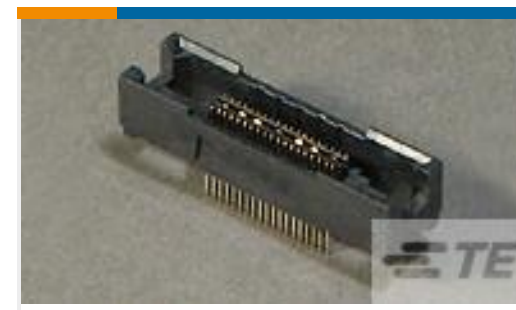
TE Part #5767044-1 MICTOR,R/A,RECPT,.062,038,ASY