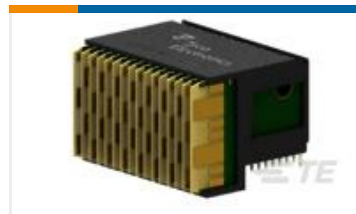
TE Part #1410187-4 MULTIGIG RT T2 7RW DC DF CT