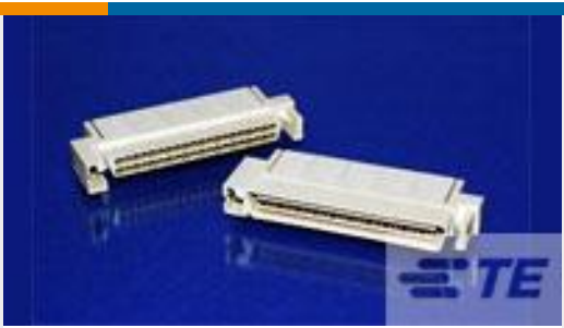
TE Part #6367584-2 ASSY Z-DOK+4 ADAPTER BRD 32PR,