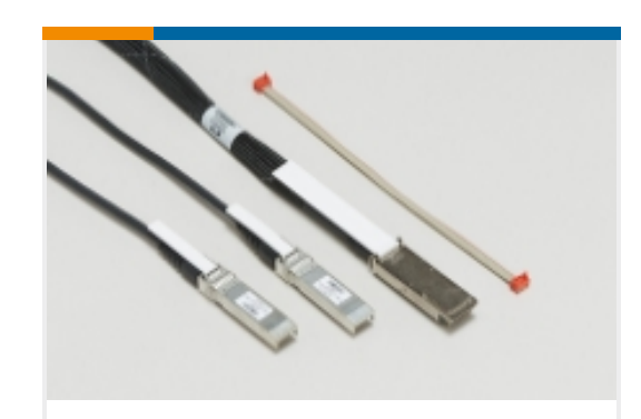
Pluggable I/O Cable Assemblies(81)