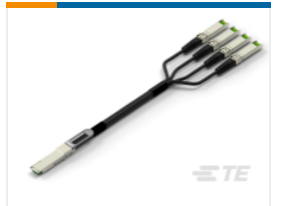
TE Part # CAT-Q17-N49011 QSFP56-Four SFP56 Cable Assembly: 30 AWG