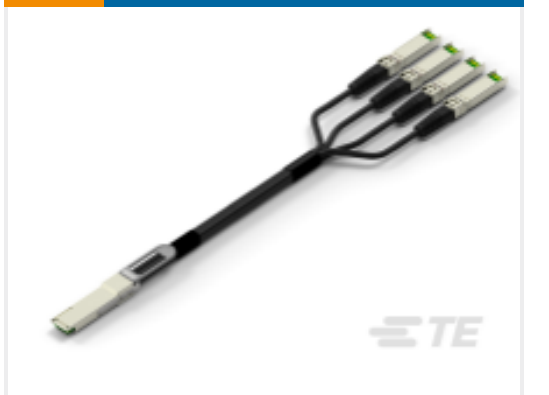
TE Part # CAT-Q17-N490333 QSFP56-Four SFP56 Cable Assembly: 26 AWG