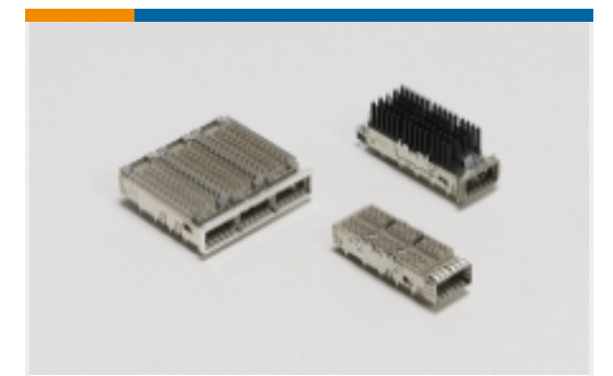
QSFP, QSFP+ & zQSPF+(432)