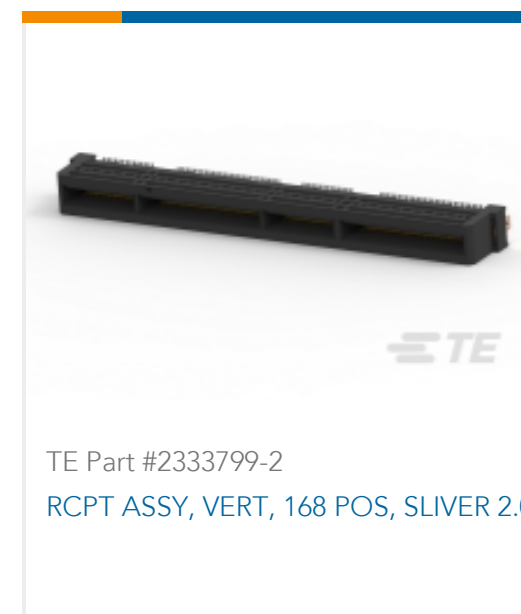
TE Part #2333799-2 RCPT ASSY, VERT, 168 POS, SLIVER 2.0