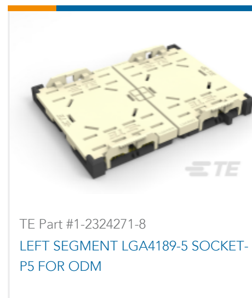
TE Part #1-2324271-8 LEFT SEGMENT LGA4189-5 SOCKET- P5 FOR ODM