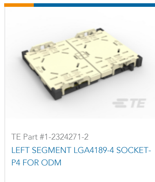
TE Part #1-2324271-2 LEFT SEGMENT LGA4189-4 SOCKET- P4 FOR ODM