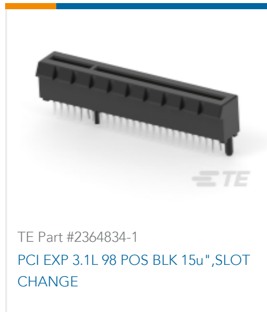
TE Part #2364834-1 PCI EXP 3.1L 98 POS BLK 15u",SLOT CHANGE