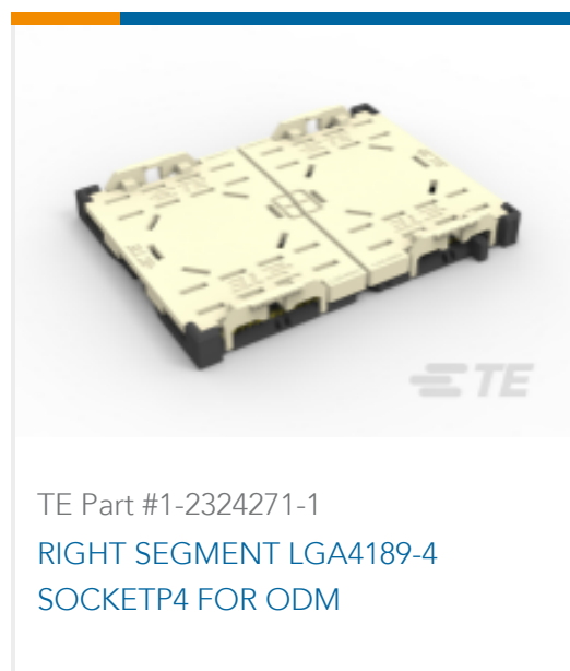
TE Part #1-2324271-1 RIGHT SEGMENT LGA4189-4 SOCKETP4 FOR ODM