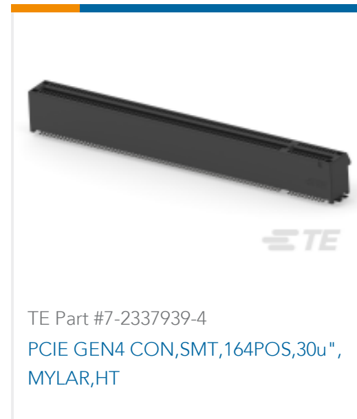
TE Part #7-2337939-4 PCIE GEN4 CON,SMT,164POS,30u", MYLAR,HT