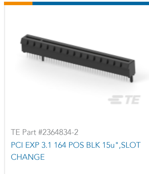
TE Part #2364834-2 PCI EXP 3.1 164 POS BLK 15u",SLOT CHANGE