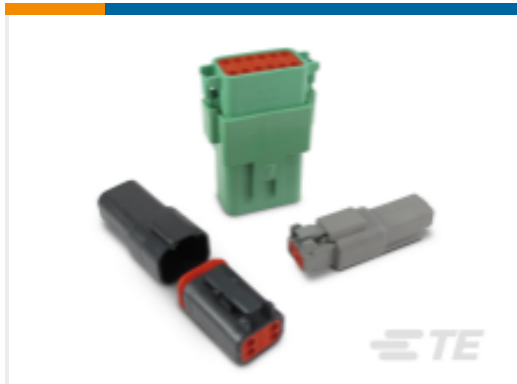
TE Part #DT04-2P DEUTSCH DT Series Housings & Connectors