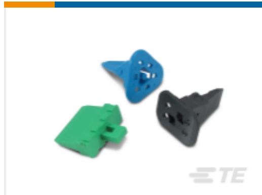
TE Part #W2S DEUTSCH DT WEDGELOCKS