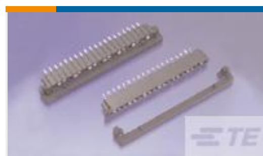
TE Part # 5-120628-8 LOCKING TRIOMATE ASY 8P(L)LDFR