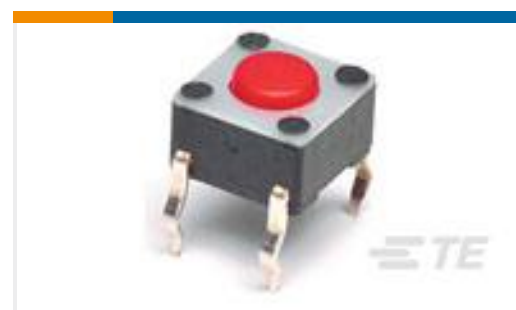
TE Part #2-1825910-7 FSM14JH=6MM TACT SWITCH, HIGH TEMP