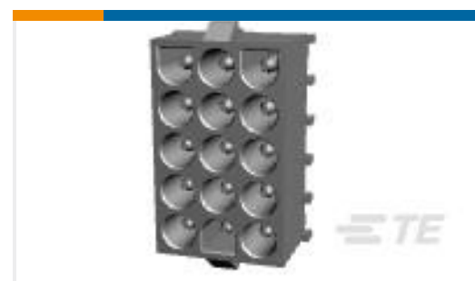
TE Part #350714-1 15P UMNL PIN HDR ASSY 94VO