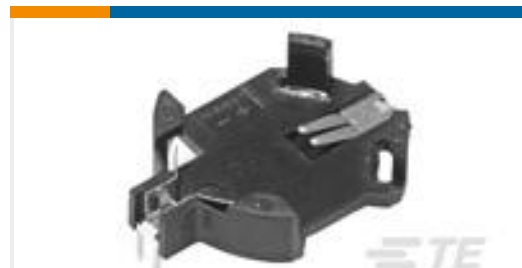
TE Part #120591-1 TOP LOAD BATTERY