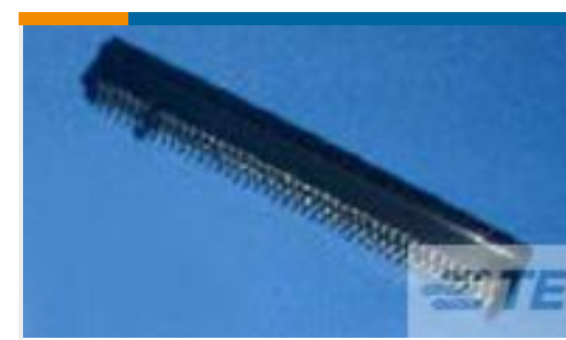
TE Part #5145154-4 STANDARD EDGE .050 SERIES 60 DUAL ASSY