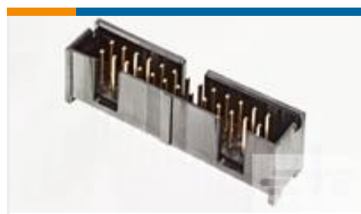
TE Part #5103308-3 A/L LOW PRO HDR 16P VERT BLACK