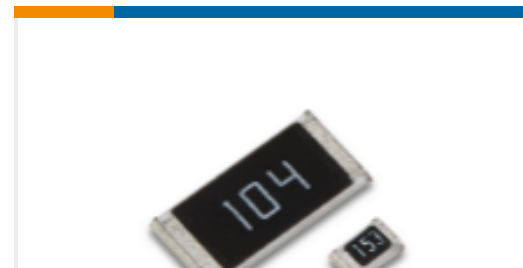
TE Part #4-2176349-9 CRGCQ 2512 100K 1%