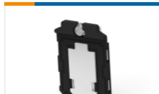
TE Part #2041549-1 SOCKET ASSY, DMD 350, T/R, G/F