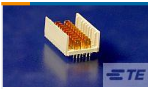
TE Part #6469025-1 HM-ZD 2PR HDR 40P 2.5MM