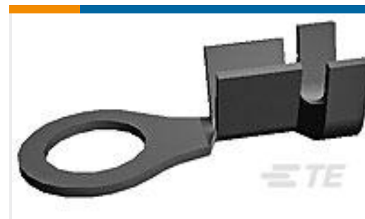
TE Part #63797-1 RING 22-18 AWG TPBR