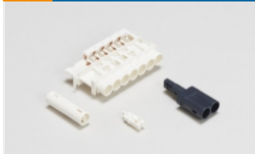
Plug & Socket Lighting Connectors(18)