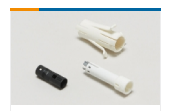
Plug & Socket Lighting Connector Accessories(6)