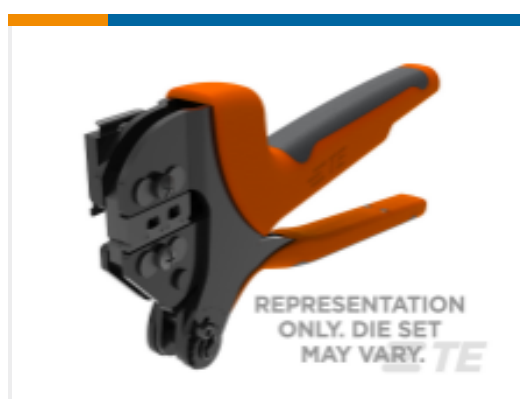
TE Part # 2392945-1 SDE F FLAT CONTACT 1.5-2.5mm2 ASSY