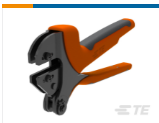
TE Part # 2362810-1 SDE CRIMP HAND TOOL FRAME W /O DIES