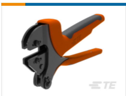
TE Part # 2362810-1 SDE CRIMP HAND TOOL FRAME W /O DIES