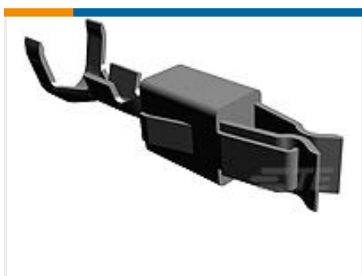
TE Part # 964287-2 JPT A REC 2.8 Contact SWS Sn (LP)