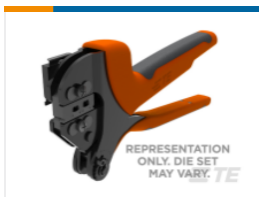
TE Part # 2390277-1 SDE F JR PWR TIMER 1.50-2.50mm2 ASSY