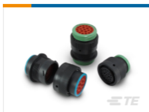
TE Part # HDP24-18-8PE-L017 DEUTSCH HDP20 HOUSINGS