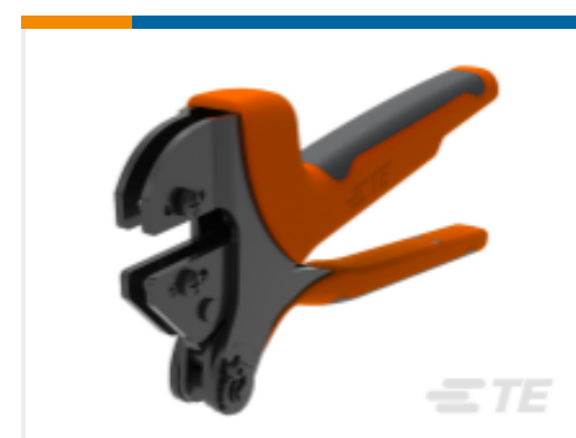
TE Part # 2362810-1 SDE CRIMP HAND TOOL FRAME W /O DIES