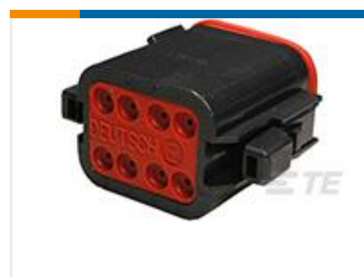
TE Part # DT06-08SB-CE06 PLG, 8P, BLK, E, SEAL RET, B