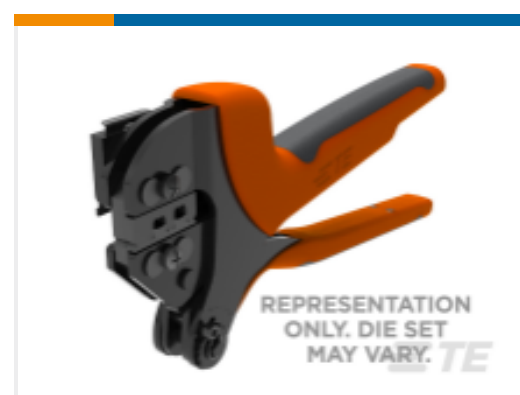
TE Part # 2391790-1 SDE F AMP MCP 2.8 1.50-2.50 ASSY