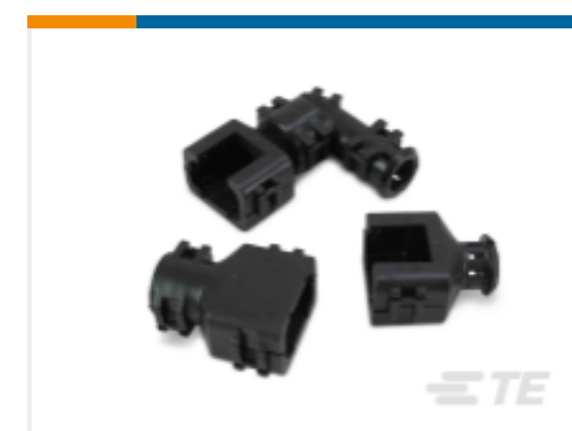
TE Part # 2292797-3 AMPSEAL 16 Connectors Backshell