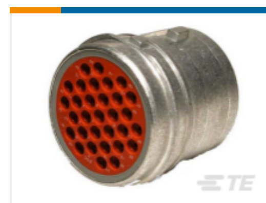
TE Part # HD36-24-31ST-B019 PLG, 31P, AL, T, CUSTOM MOUNT, 16, P