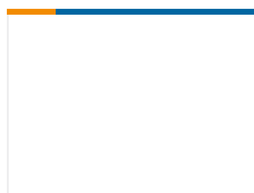
TE Part # DT04-4P-KIT DT04-4P AND WEG ONLY