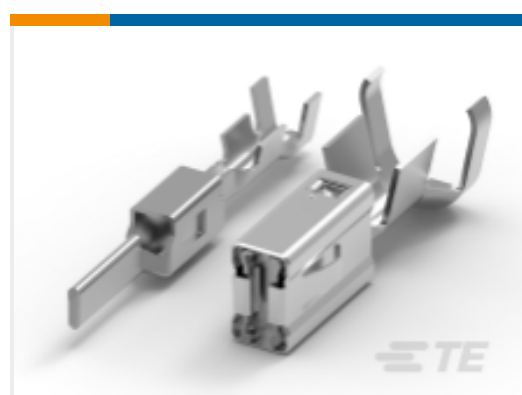
TE Part # CAT-AM705-T273 AMP MCP, RECEPTACLE AND TAB