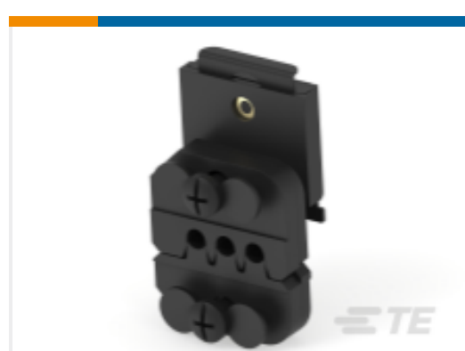
TE Part # 2392221-2 SDE AMP MCP 2.8 0.21-0.35 DIE SET